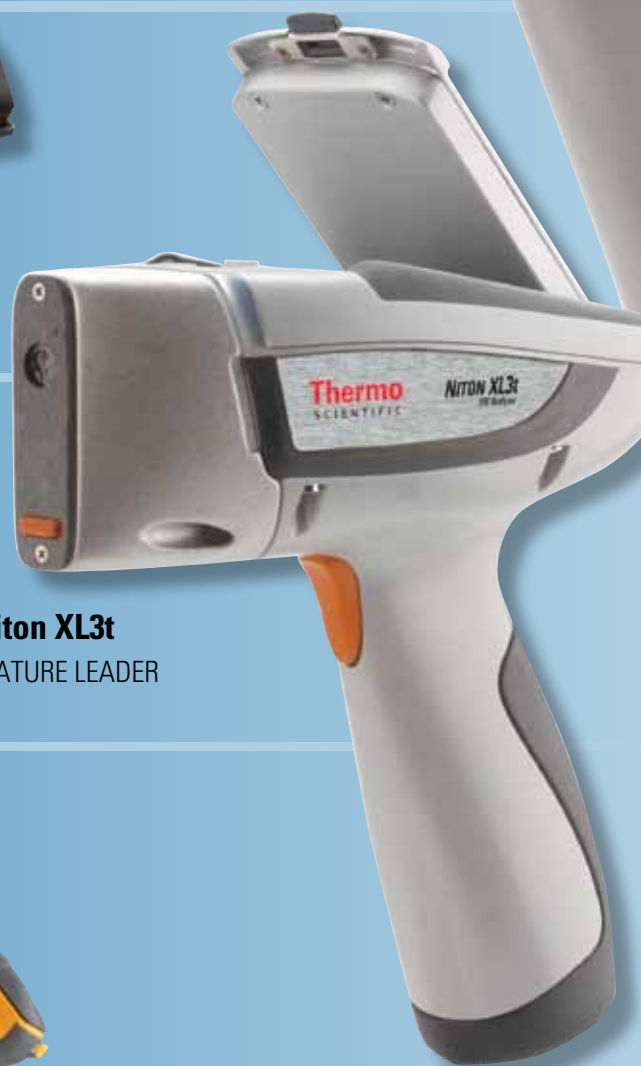
Niton XL3t FEATURE LEADER