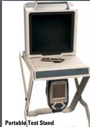
Portable Test Stand