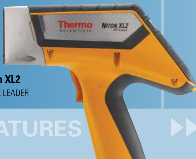
Niton XL2 VALUE LEADER