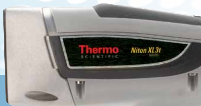
Niton XL3t GOLDD+ ULTIMATE PERFORMANCE AND FEATURES