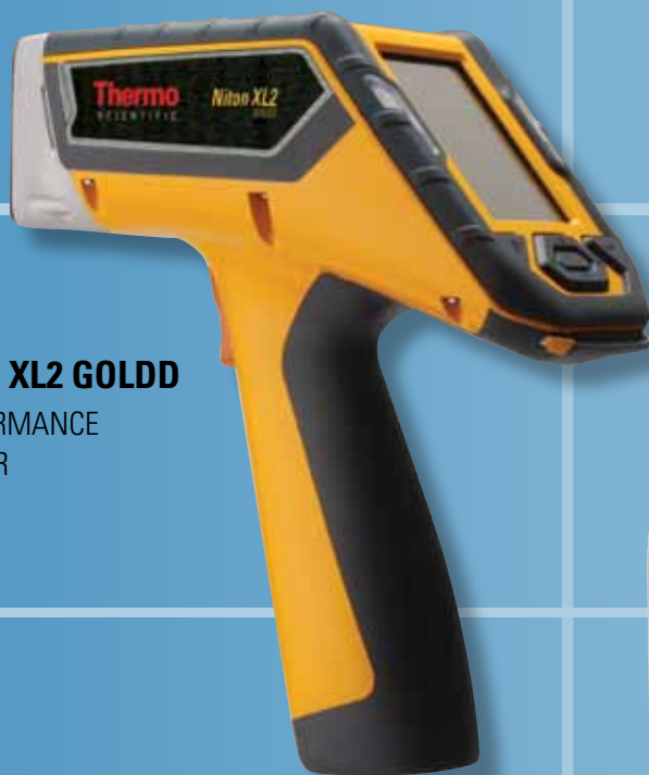
Niton XL2 GOLDD PERFORMANCE LEADER