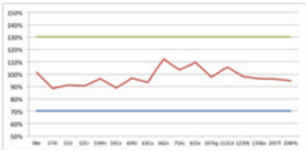
Figure 6. Laboratory fortified matrix minor & trace element recoveries (Method specified 70 – 130% limits shown)

The Laboratory Fortified Matrix (LFM) checks the recovery of analytes in a matrix every 1 in 10 samples (Figure 6).