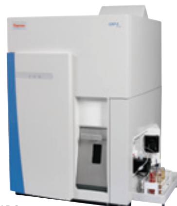
Figure 1: The Thermo Scientific iCAP Q

A Thermo Scientific iCAP Qa ICP-MS was used for all measurements since it is not equipped with collision cell technology. The instrument was therefore operated in standard (non collision cell) mode. In this mode, the QCell in the iCAP Q is not pressurized with a gas and acts as an ion guide. The sample introduction system used consisted of a Peltier cooled (3 °C), baffled quartz cyclonic spray chamber, PFA-ST nebulizer and quartz torch with a 2.5 mm i.d. removable quartz injector. All samples were presented for analysis using a SC-4DX autosampler with integrated 7-port FAST valve from Elemental Scientific (Omaha, NE, USA).